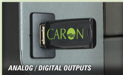
ANALOG / DIGITAL OUTPUTS