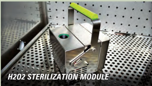
H2O2 STERILIZATION MODULE

Add in patented* H2O2 chamber sterilization for elimination of parasites, mold, viruses, and bacteria, a humidity control system, or digital or analog outputs for remotely monitoring.